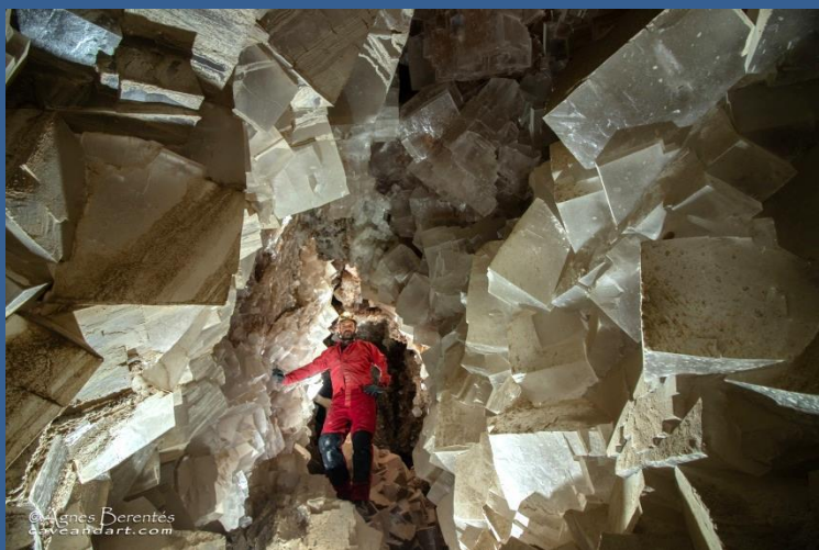
Giant salt crystals in a cave on Mt. Sedom (Dead Sea, Israel), EuroSpeleo Project ESP 2022-12 (Bulgaria).