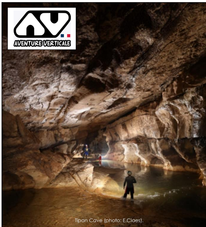
Tipan Cave (photo: E.Claes).